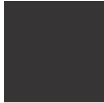
C H A R C O A L # 0 B 0 B 0 B