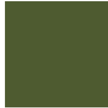
P I N E # 4 E 5 B 3 1